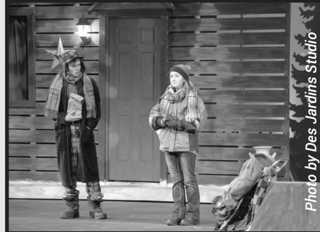
See a Show