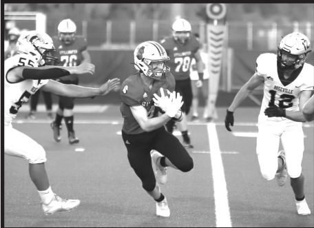
Go to a Sporting Event