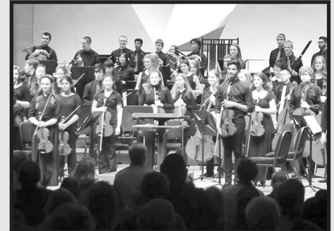
Enjoy a Concert

Visit our Pony Fan Hub for a calendar of high school sporting events, concerts and shows goponies.stillwaterschools.org/fan-hub